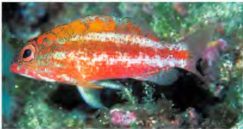
FIGURE 5. Rare color pattern of Serranus pulcher , near Rolas Islet, São Tomé.